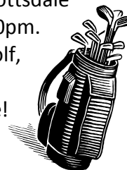
3RD SUNDAY OF EASTER